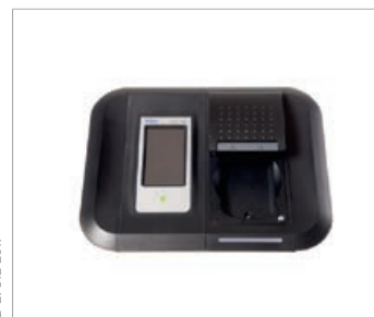
Protective rubber boot